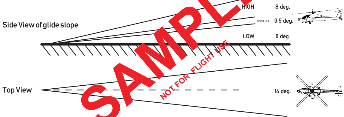
Fig. 1 Beam height and width

Because the system is portable, size, weight and deployment considerations mean that signals differ from those produced by fixed systems, as the GL3 generates signals electronically without using mechanical means, although enough similarities remain to enable any pilot used to flying on to a VASI, PAPI, HAPI or triVASI to rapidly become familiar.